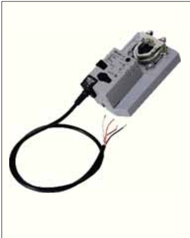
VMS-716 Part No. 204-610