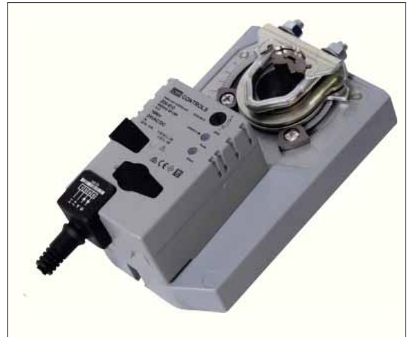
CMR VMS-716 Damper Actuator

A 1m long cable is factory fitted and can be terminated according to a wiring diagram which is on a label fixed to the actuator. The damper motor is factory tested and pre-set to a standard operation.