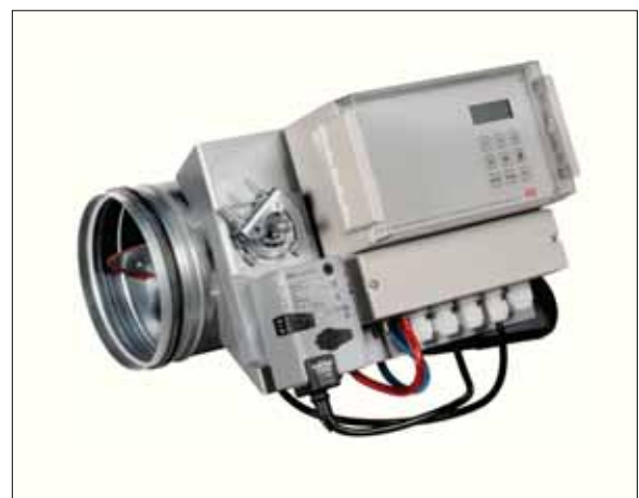
DPC Volume valve with VMS-716 Actuator