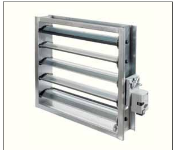
CMR Damper with VMS-716 Actuator